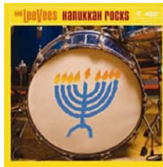
Indie pop that will melt your gelt